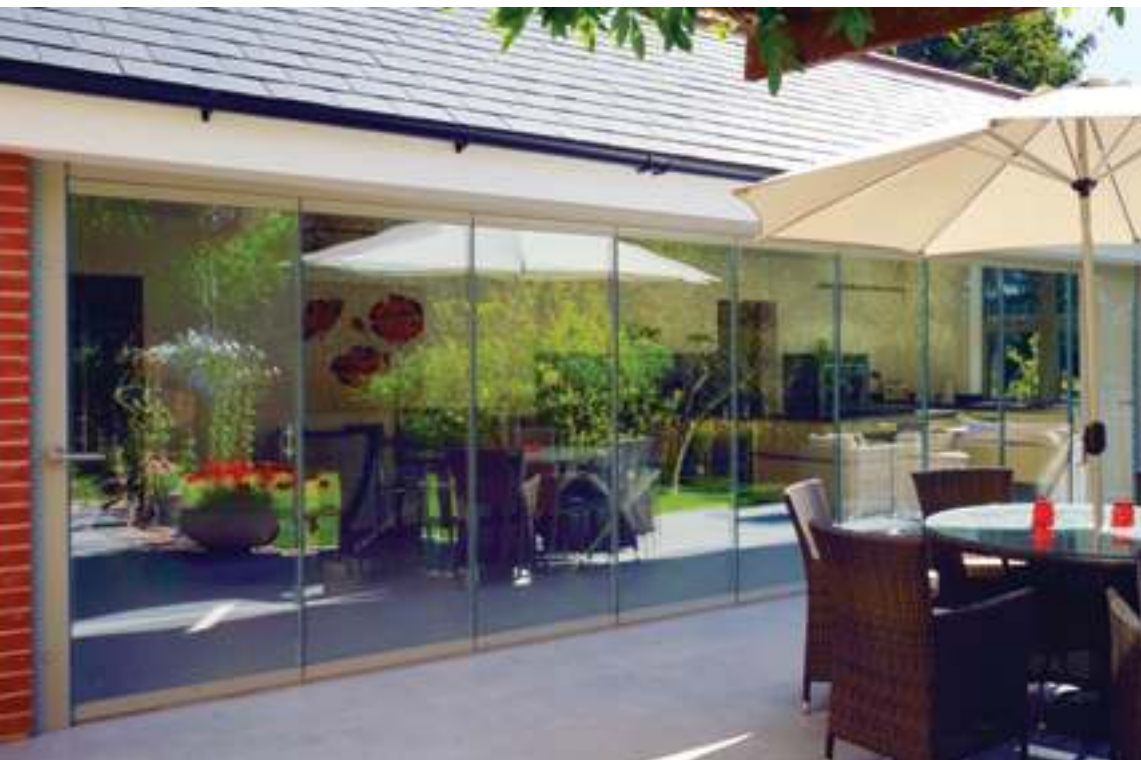
Private residence, Stowmarket