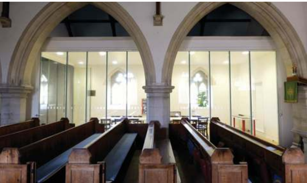
Church, Crowhurst. 3.1 m high 'Clearline' glass curtains around sound-proofed children's play area