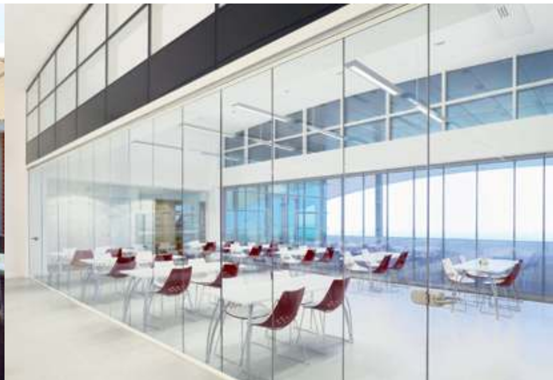
View of Manchester United's training ground staff restaurant looking through single-glazed curtains to restaurant extension with double-glazed curtains opening onto viewing area in the background