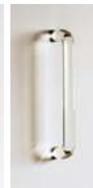
Choice of stylish glass handles