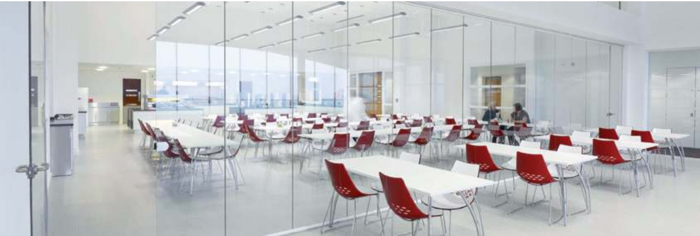
Recently completed installation at Manchester United's training ground staff restaurant. 18 single-glazed curtains each measuring 2.9m high x 0.8m wide