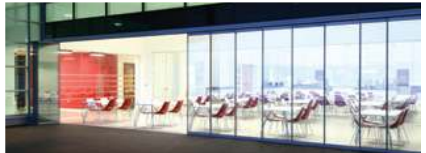
Exterior view of Manchester United's training ground staff restaurant showing double-glazed curtains opening onto viewing balcony