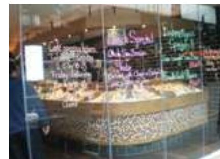
Retail installation, single-glazed