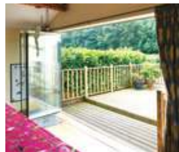
Private residence, Wells