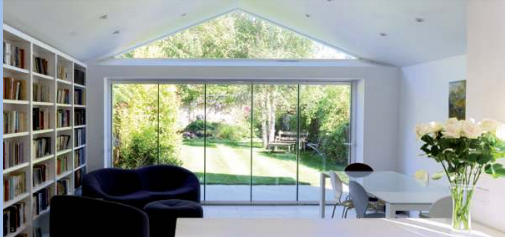
Private residence, Oxford

Clear views come as standard with 'Clearline' – truly frameless glass curtains