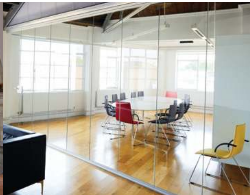
Architect's practice, London

'Clearline' Frameless Glass Curtains bring an exciting new dimension to any property. Suddenly, rooms are flooded with light as a garden or a patio blends into the building to become part of a fresh living experience.